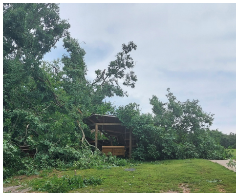
Day of Destruction, Aug. 7, 2023